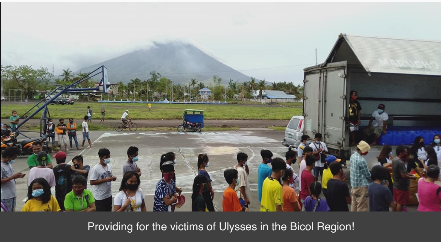
Providing for the victims of Ulysses in the Bicol Region!

Go Fund Me will be unveiled in our March Newsletter!