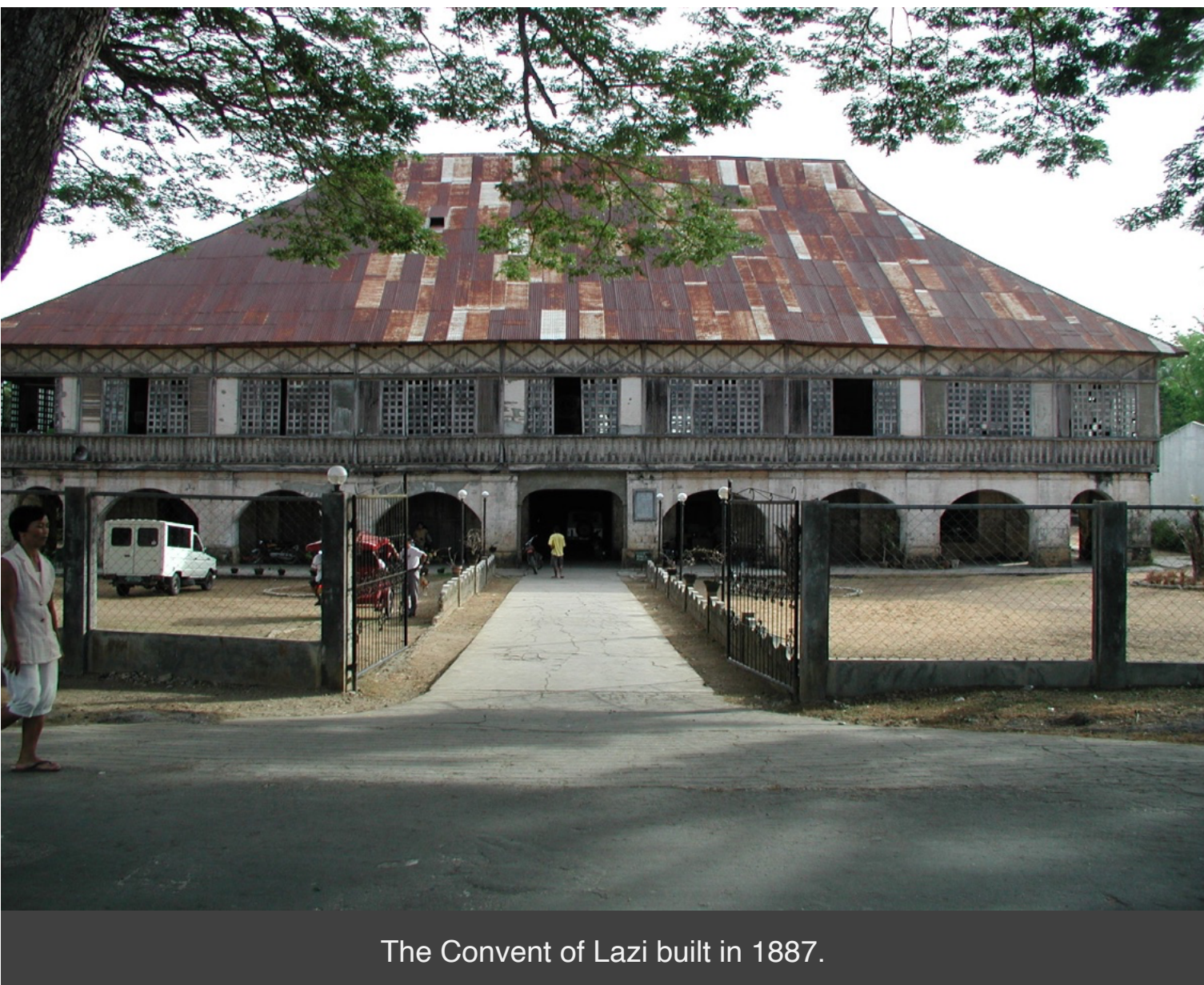
The Convent of Lazi built in 1887.

On September 19, 2019, our Society started a partnership with the Missionaries of Jesus to annually fund the education of 10 "lumads" in Malita, Davao Occidental through the MATAMIS PROJECT - Malita Tagakaolo Mission. A grant of US$2,000 covers $1,800 for ten students and $200 for the development of teachers. This is a follow up to our mission of helping our indigenous people like the one we successfully completed in 2018 with the Aeta Foundation.