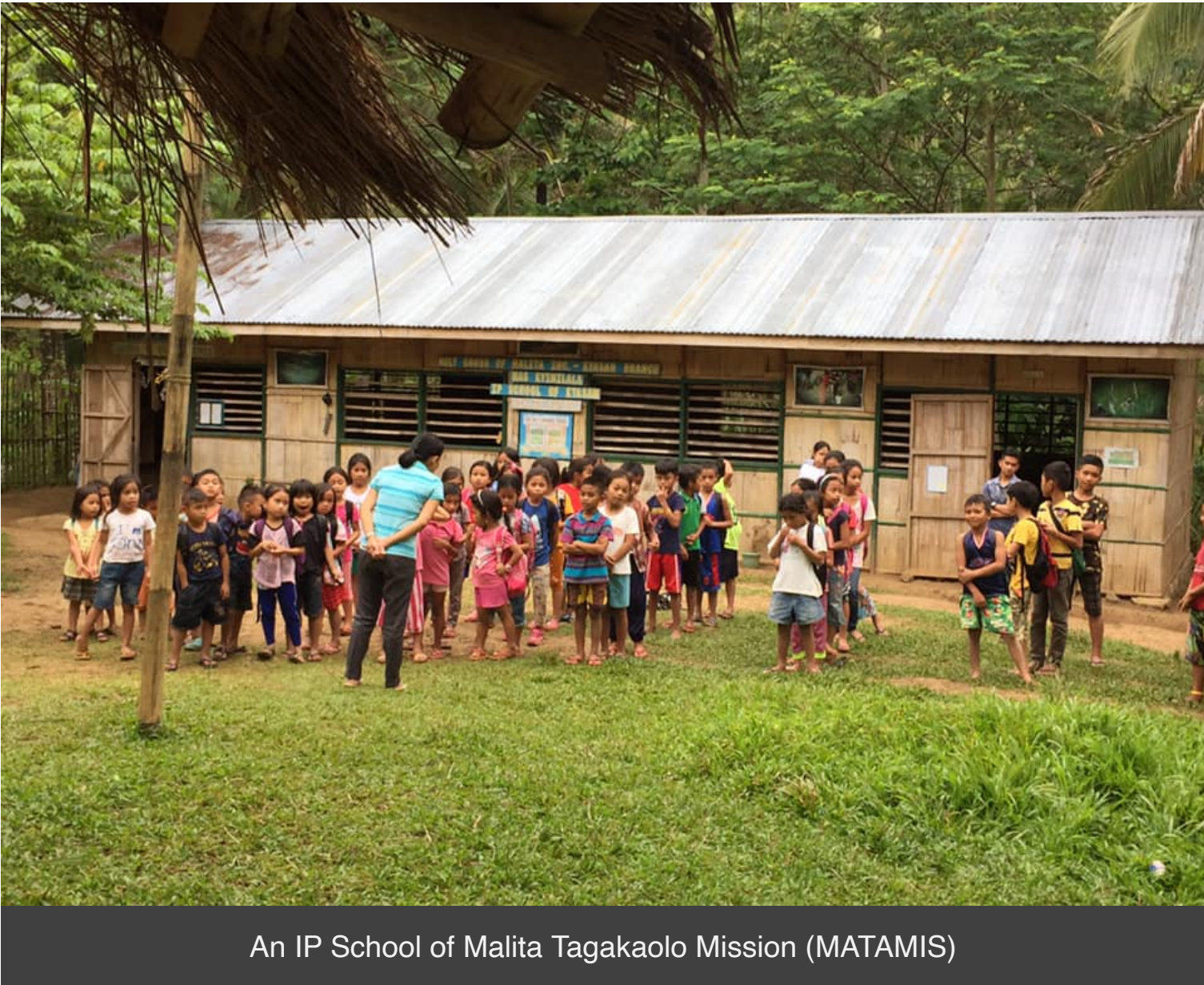
An IP School of Malita Tagakaolo Mission (MATAMIS)